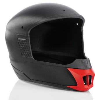
The helmet prototype was 3D printed in one build on the Stratasys F370.