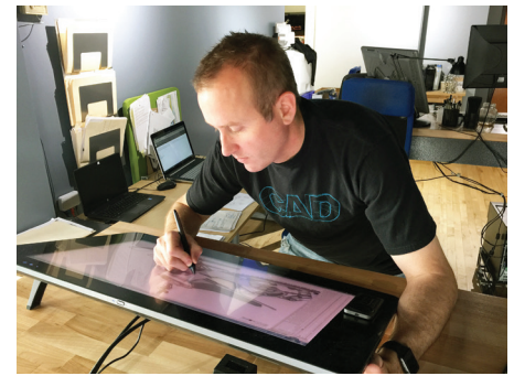
CAD specializes in creating complex surface geometry for the plastics industry.

Features of the Stratasys F370 like its minimal setup, fast-draft mode and auto-calibration ensure less time troubleshooting and more time for the team to tackle the next complex design.