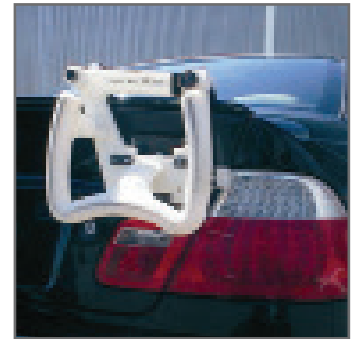
In the jigs and fixtures department at BMW AG, Regensburg, a Fortus system is used to manufacture assembly tools. This tool is used to affix the rear name badge.