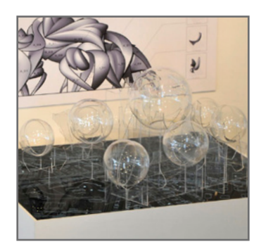
A photo of the finished product is shown behind the platform on which it will eventually rest.

Stratasys | www.stratasys.com | info@stratasys.com