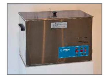
Supports on the parts are dissolved away in a tank filled with an alkalinebased solution.