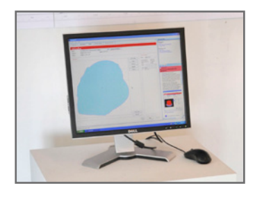
One of the parts being created is shown on a monitor so visitors can follow the process.

BplusU creates two types of architectural models. Some are mounting models, which are solid. Others are surface geometry models, which are representations of the outer skin of a building. Most of the work is for commercial buildings. "Having our own 3D printer makes sense because of the complexity of the geometry we're working with," Baumgartner said. "There is no other way to build some of our models than with 3D printing."