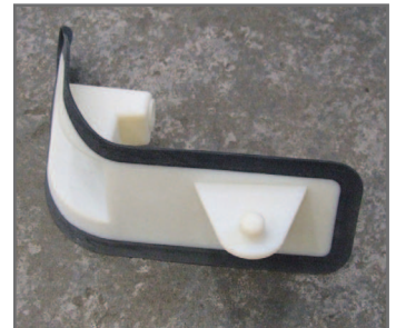
More than 2,500 single and multi-material prototypes have been produced to date.

Stratasys | www.stratasys.com | info@stratasys.com