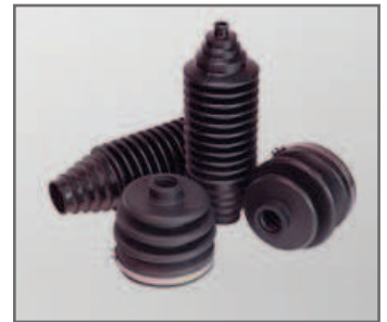
The company purchased the Objet500 Connex to broaden its rapid prototyping capabilities.