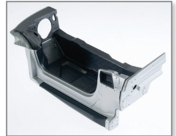
These 1/6 scale FDM prototypes helped Lamborghini Lab determine fit and improve load paths.

Stratasys | www.stratasys.com | info@stratasys.com