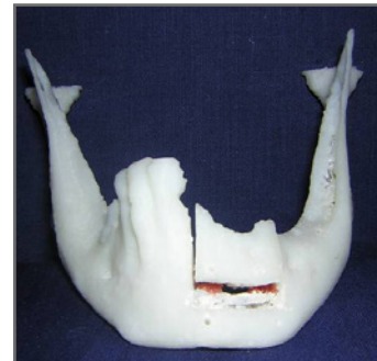
The bone defect can be measured to decide how to simulate and shape the bone distraction plate.

The clinic's relationship with Stratasys continues to grow. The clinic has just purchased a new Dimension Elite from Technimold, Stratasys' licensed Italian reseller.