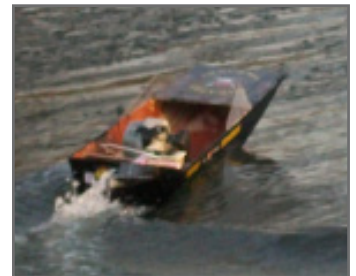
Propellers were put to a real test on a pond near the college.

Stratasys | www.stratasys.com | info@stratasys.com